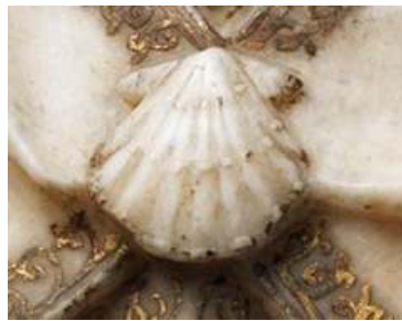
Scallop shell symbol of St James (detail, St James statuette, Metropolitan Museum of Art)

The Indianapolis Museum of Art holds a fifteenth-century altarpiece in the form of a triptych (three folding panels) with twelve frames portraying various phases of the life of St James. Among the episodes featured are the miraculous transport of James’s body to Spain, his role as the ‘Moor-Slayer’, his arrest, trial and martyrdom and some of the miracles attributed to him. It has been speculated that the Indianapolis altarpiece ‘might well have served a pilgrimage church on the route to Compostela as a comprehensive indicator of the principal aspects of the St James legends’. 24