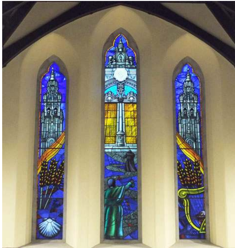
Santiago de Compostela stained glass window at western end of Pearse Lyons Distillery, in restored St James's Church, Dublin