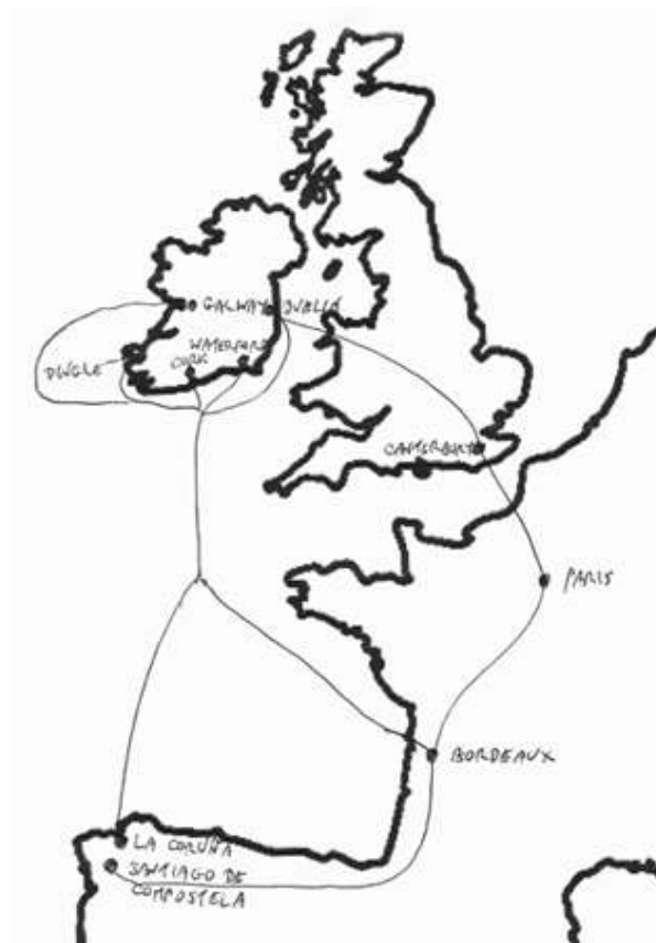
Pilgrim routes from Ireland to Santiago de Compostela