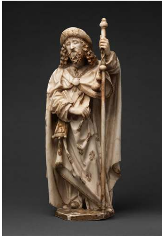
St James in pilgrim dress (statuette by Gil de Siloe, 16th century, Metropolitan Museum of Art, New York)