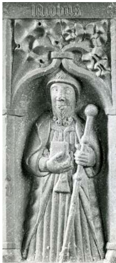
St James (Jacobus) the Greater, with pilgrim symbols, Kilcooley Abbey, Co Tipperary (TARA, Trinity College Dublin)

More expensive souvenirs were carved from hard jet stone and were called 'azabaches' after the Spanish word for jet. These were carved as images of St James, crosses, medallions and in other forms. While no example of an azabache has been found in Ireland, a striking fifteenth-century jet carving of St James and a disciple, which originated abroad, is now held by the Hunt Museum in Limerick. 28