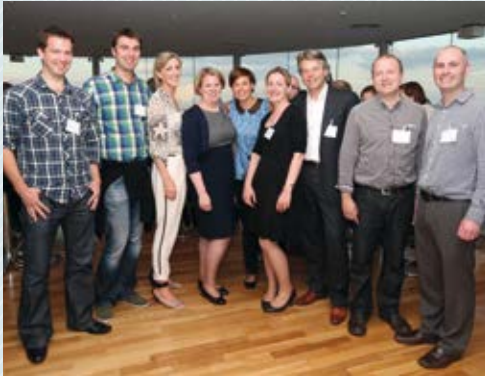
Guests enjoying The Digital Hub's 10th Anniversary Networking Social in the Guinness Storehouse.