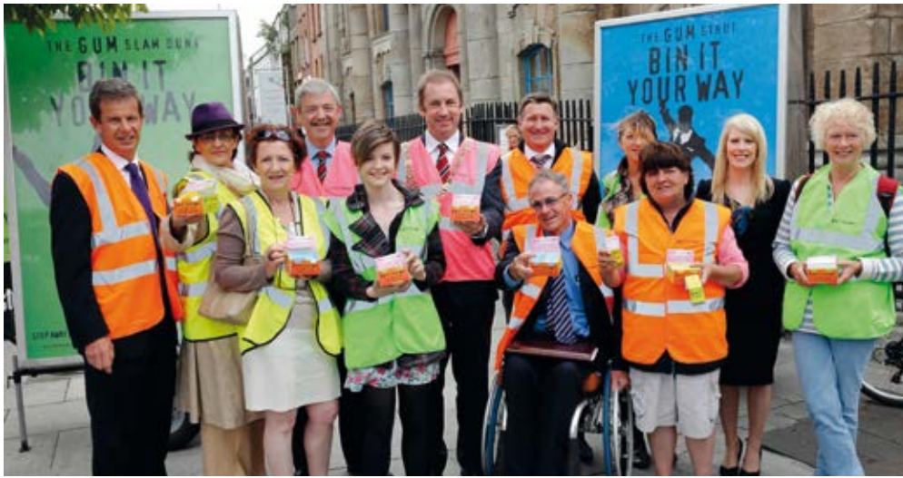
The Lord Mayor of Dublin, Oisín Quinn, joins representatives from Thomas Street to promote the 'Bin It Your Way' campaign.

A National Digital Strategy for Ireland was launched in July by the Minister for Communications, Energy and Natural Resources, Pat Rabbitte TD. The strategy aims to promote digital in areas such as entrepreneurship, business and education. It focuses on helping small businesses expand online, preparing young people for future jobs, and ensuring that all people in Ireland benefit from digital. The Digital Hub Development Agency welcomes the Government's focus on digital and looks forward to working with national and local government to implement the new strategy. For more information on the National Digital Strategy, see www.dcenr.gov.ie/nds .