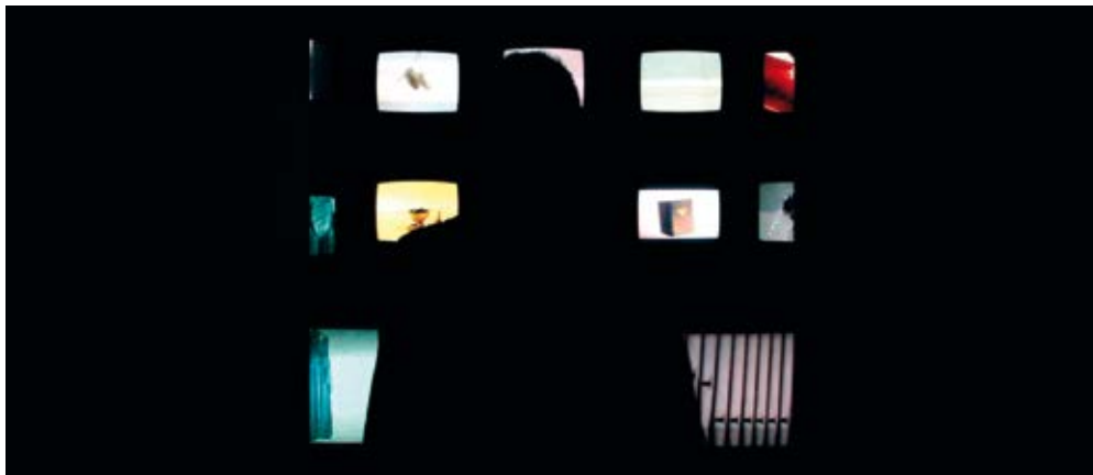
A visitor is captured viewing one of the many exhibitions at NCAD this summer.

Website: www.libertyflorist.ie Tel: 01 4545455 Mob: 085 8198118 Email: info@libertyflorist.ie