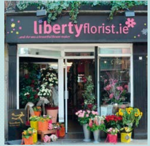
Liberty Florist is a small, Irish-owned flower shop, located in the heart of the Liberties.

What do you think has changed most about Thomas St. in the last five years? I live in the area and work in the area, and have known it for quite a while. What's different in the last 10 years, as opposed to the past five years, is the amount of new people coming to the area. This is partly due to Vicar Street and The Digital Hub bringing different people to the area. There are also lots of tourists in the area that bring another unique part to the street. Thomas Street is a very, very unique street.